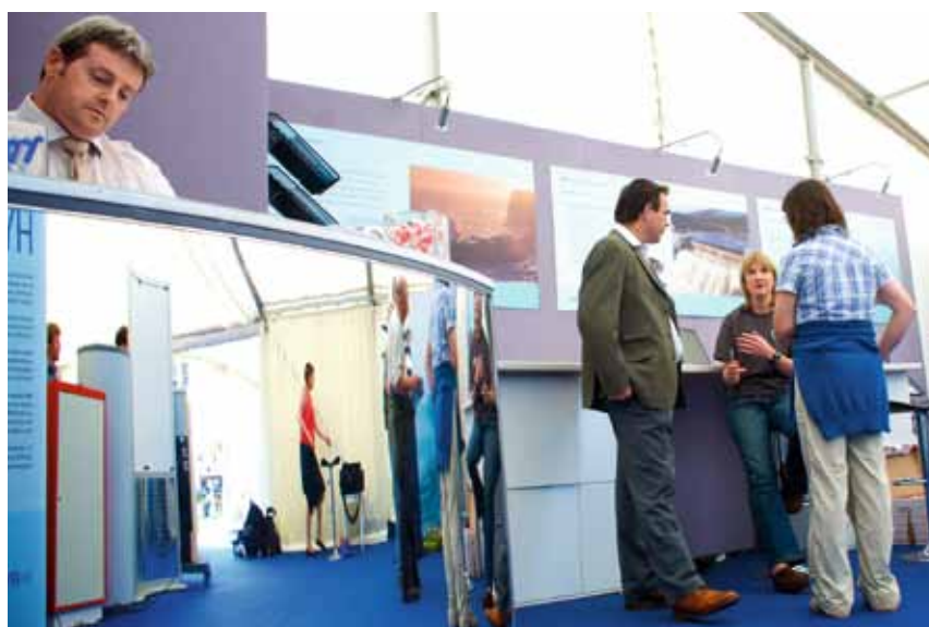
RWE npower renewables' staff talking to members of the public