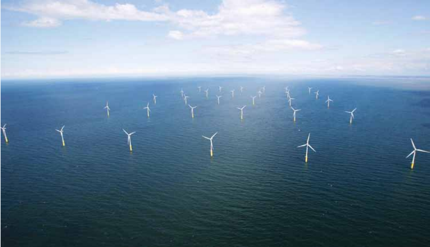
North Hoyle Offshore Wind Farm