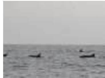
Pod of Bottlenose Dolphins