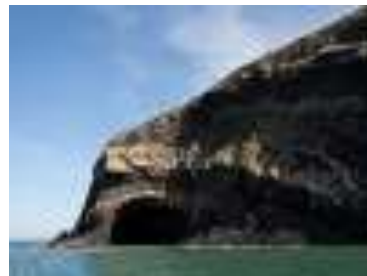
Pembs Sea Cave