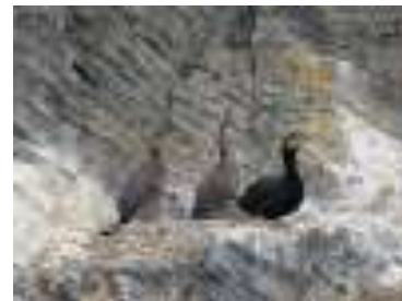
Shags - Adult & Juveniles

.....a sample of what we often see on Charter, all taken from aboard our RIBs in Pembrokeshire!