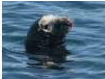
Atlantic Grey Seal Cow