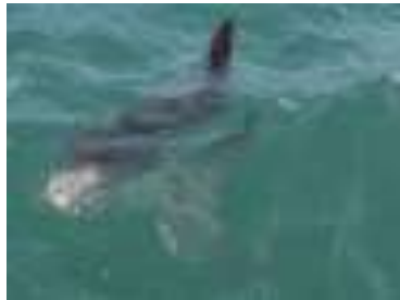
Mola-mola - Sunfish

Taking people to see the amazing coastline and rich wildlife we have here in Pembrokeshire....taking care to respect and not to disturb their environment too much!