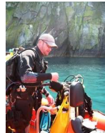
Monty Halls – Diver and TV Presenter