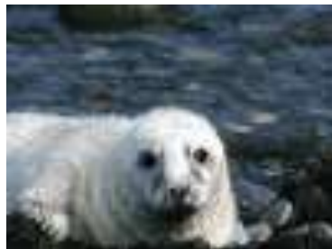
Atlantic Grey Seal Pup