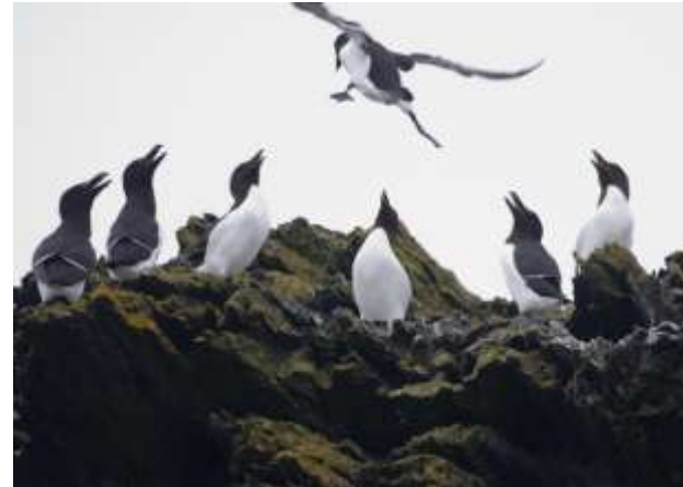
A Razorbill coming in to land!