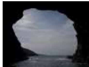
Inside a Sea Cave