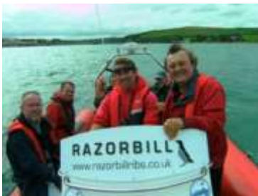
BBC Coast – Mark Horton

Largely due to the beautiful coastline and abundance of wildlife (sometimes rare) which we have in Pembrokeshire, there are often television crews who want to come and film here. They often need the knowledge of local operators to get the footage they want to capture!