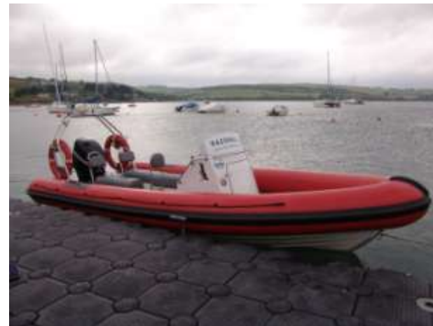
'Razorbill' one of our RIBs