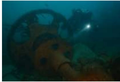
'Dan Beard' Wreck – Winch Gear