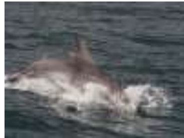
Bottlenose Dolphin Jumping